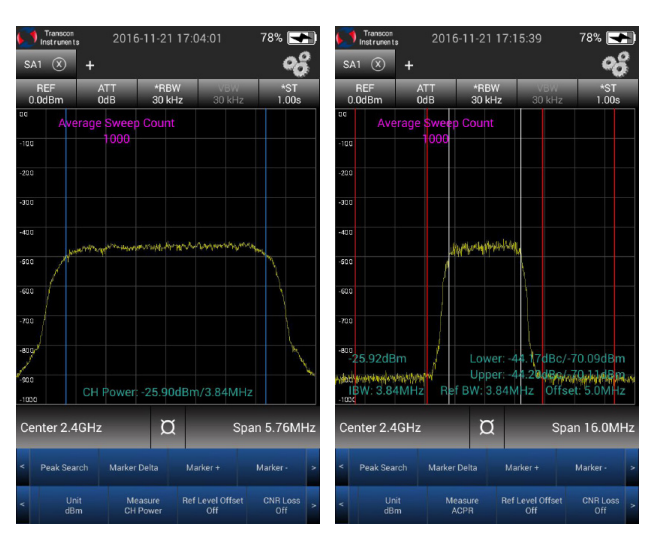
Channel power measurement