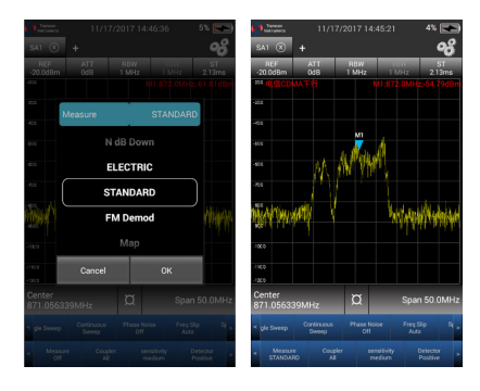
FM demodulation and locating