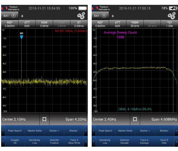
General spectrum test