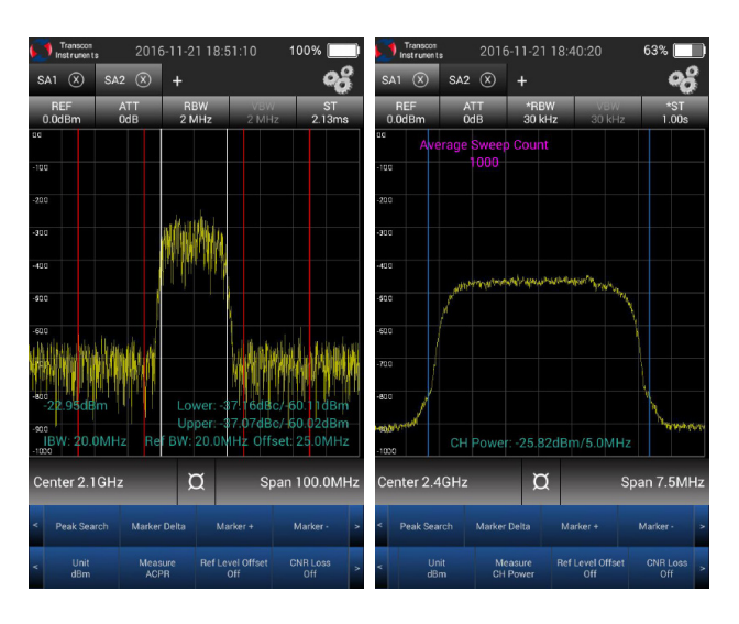
Spectrum measurement of main communication signal