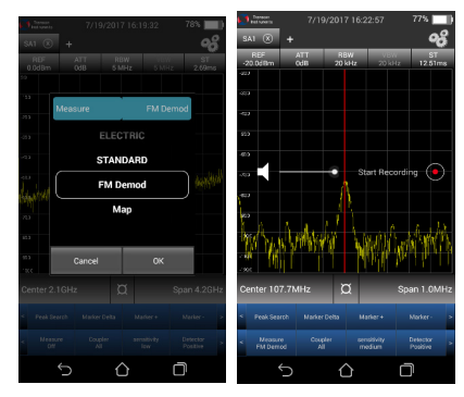
Frequency attribution identificationm