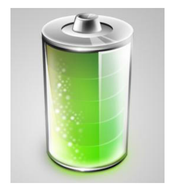
SpecMini is able to work for 6 hours. and equipped with the protective circuit.