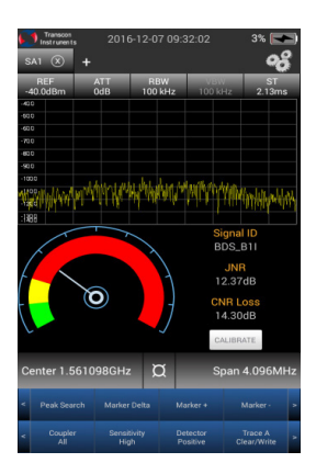
GNSS interference Analysis