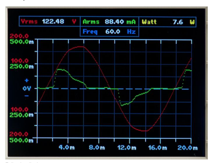
Full color display

The color graphics display on the PA1000 is unmatched among single-phase power analyzers. It provides intuitive readout of not only measurement values, but also harmonic bar charts, waveform display, energy integration plots and more. Setup of the PA1000 for your particular application is also easy and flexible, using the menu-driven interface and soft keys.