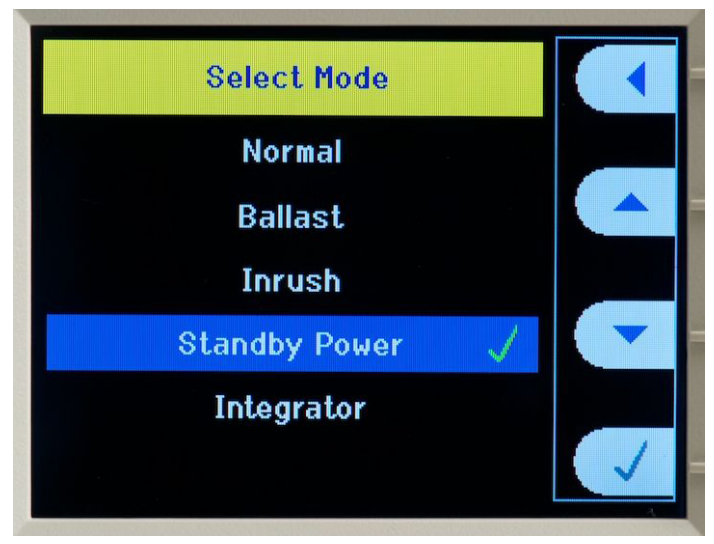
Selection of application-specific test modes

Some applications require special instrument settings to ensure proper measurements. The PA1000 simplifies setup for these applications by automatically choosing instrument settings and parameters that are optimized for each type of measurement application, resulting in more reliable measurement results with less opportunity for user setup error.