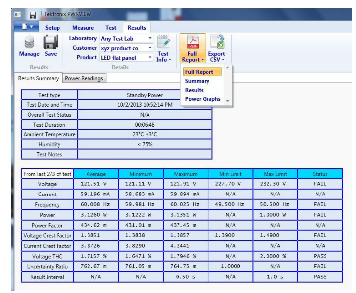
Full test results report