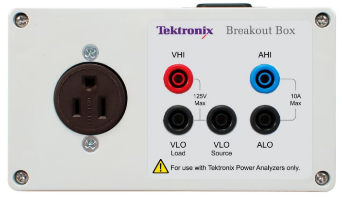
BB1000-NA breakout box

PA-LEADSET Replacement lead set for Tektronix Power Analyzers (one channel lead set)