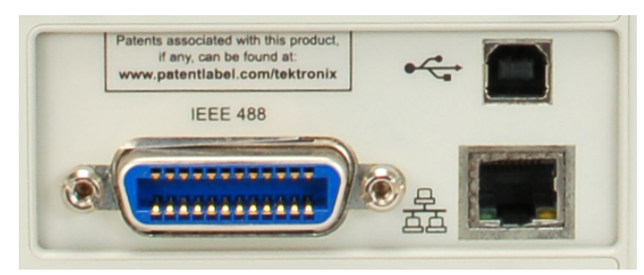
PA1000 rear panel communication ports

The PA1000 comes standard with USB, Ethernet and GPIB communication ports, plus a front-mounted USB port for data logging to a flash drive.